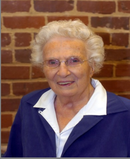
VIOLA STARTZMAN FREE CLINIC